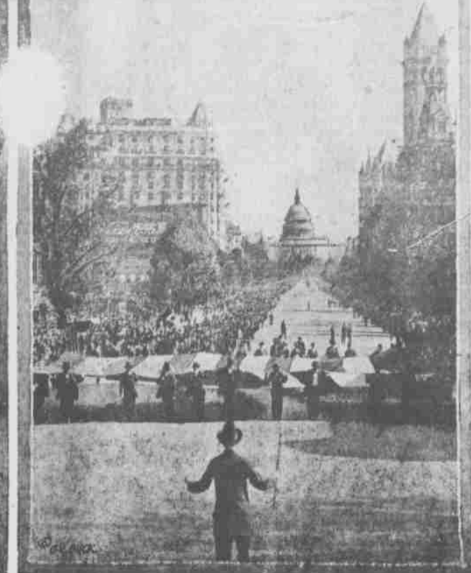
View of parade taken from the Trasury Building with the Cap-