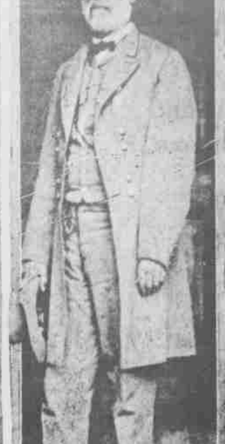
General Lee During the War.

Flour market is gaining in activity but no change in price is 51 thold Indian reservation. North Danounced. In the meantime millers kota. The applicants, with the exare watching the wheat market with ception of war veterans, must register in person at either Minot, Bis-marck or Plaza, N. Dak.