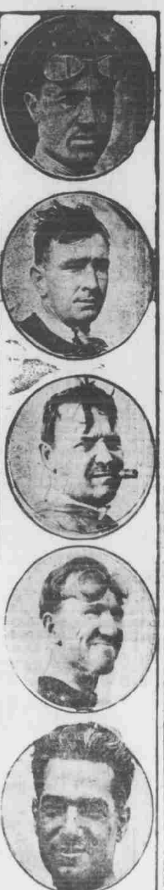
From top to bottom: Dario Resta, Bob Burnut, Barney Oldfield, Earl Cooper, Ralph De Palma.