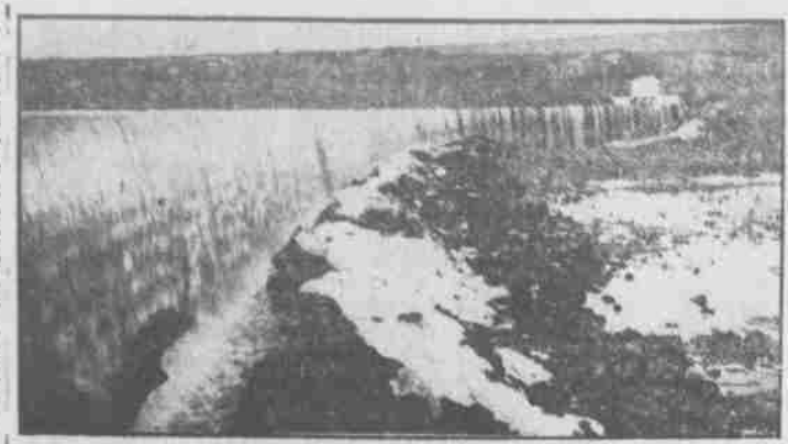
WATER FLOWING OVER DIVERSION DAM OF WEST UMATHLA

known to the factors in the successful development of these lands is their very early season and their com-parative freedom from frost. The lands to be irrigated lay along the