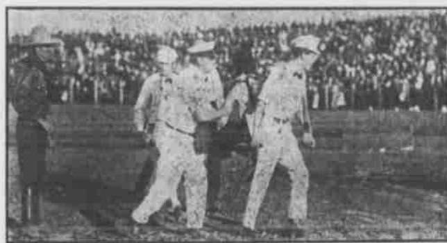
Carrying Away the Round-Up Injured