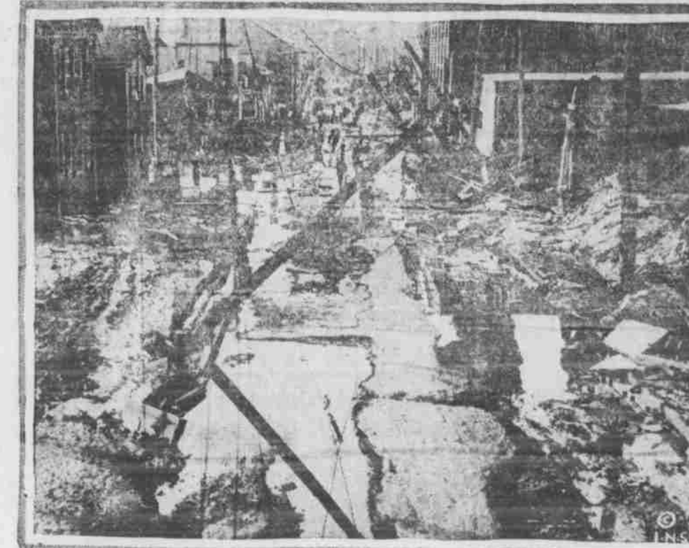
WRECKAGE ON FRENCH ST. ERIE. The above photographs show the immense damage done by floods in Erie, Pa., when upwards of 60 persons lost their lives.