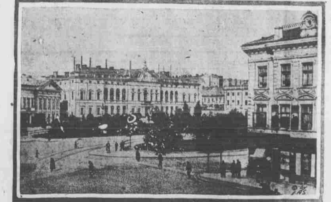
THE PLACE KRASINSKI - WARSAW This picture shows the Place Krasinski in Warsaw, around which the Germans are closing on three sides. Its fall is momentarily expected.