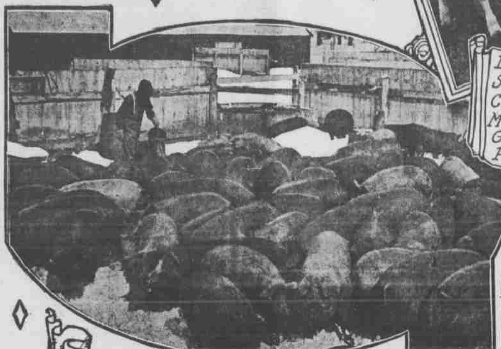
PORK PRODUCTION CHEAP IN THE SOUTH