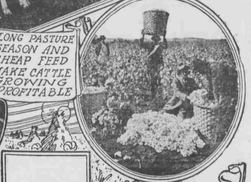
LONG PASTURE AND CHEAP FEED MAKE CATTLE GROWING PROFITABLE

"The South Will Feed Herself." These significant words, full of action and determination, have been chosen as a motto by many of the cotton-growing states which have come to realize the warning spoken by the far-seeing humanitarian and statesman, Henry W. Grady, nearly forty years ago, that: "To mortgage our farms in New York for money with which to buy meat and bread from outside sources is not good business. When every farmer in the South bread from his own field, meat from his own pasture, vegetables from his own garden, fruit from his own orchard, and butter and milk from his own dairy; caring for his crops in his own wisdom and growing them in independence; making cotton a surplus crop and selling it in his chosen market; in his own time, for cash and not for a receipted mortgage—then the South will begin to realize the fullness of her opportunities."