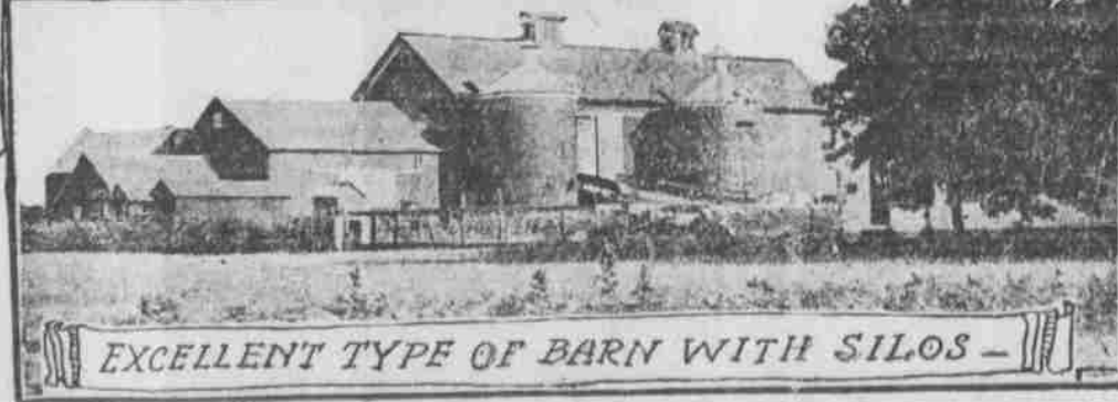
EXCELLENT TYPE OF BARN WITH SILOS.