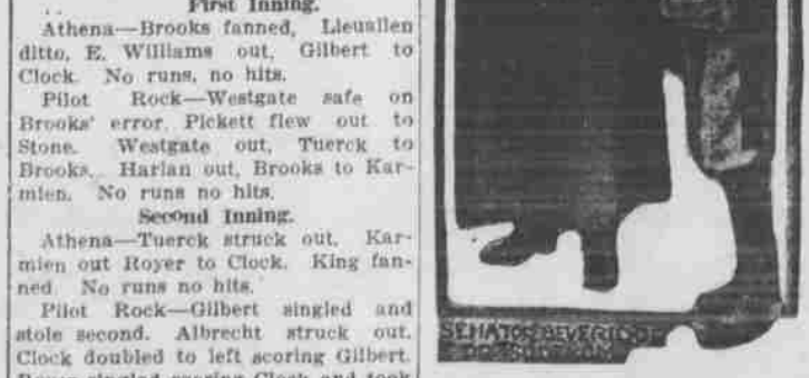
NEW YORK, July 12.—Former Senator Albert J. Beveridge, who was on both the German and French battlefronts in Europe, in a speech here asserted the war is not a conflict brought on by rulers and against the will of the people.

STANDARD OIL COMPANY (California) Pendleton