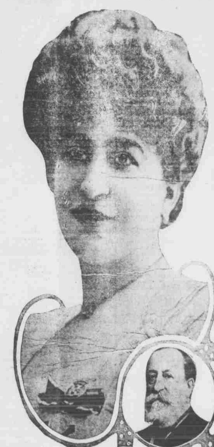
NEW YORK, June 4.—When the transatlantic liner "Rochembeau" had warped into her dock four dignified men came down the gangplank. A handsomely dressed woman rushed up, with arms extended. "Maestro," she cried, "I am so happy to see you; so very happy."

THE CLUTCHING HAND —In— THE DEVIL WORSHIPERS