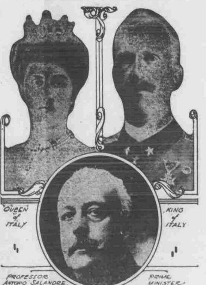
The official declaration of war against Austria became effective today. Germany has announced a "state of war" to exist with Italy also and a declaration from Turkey is expected hourly. The accompanying photographs show the prime figures in the Italian crisis.