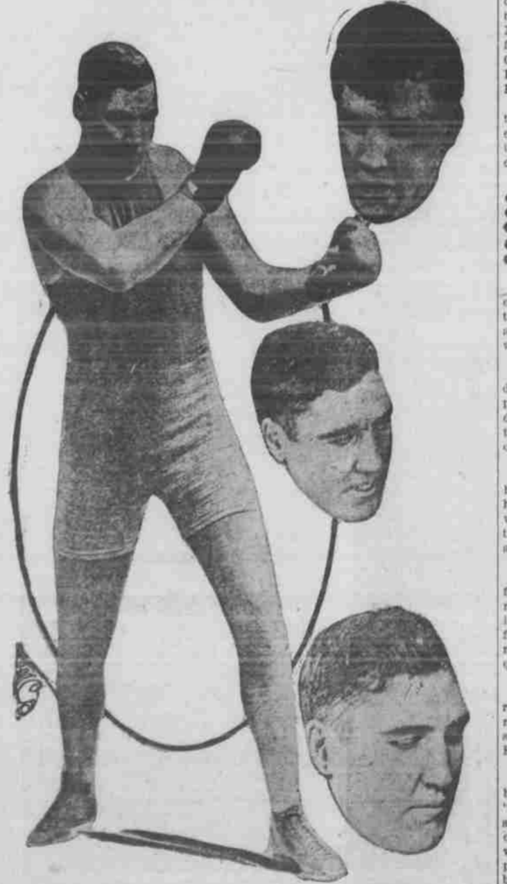
This is the new champion of the prize ring. Jess Willard won from Jack Johnson April 5, 1915, in Havana, and therefore succeeds to whatever title Johnson held. Whether the contest was a fake is something that must be determined later. At the time this is written the sporting men present seemed unanimous that Johnson was fairly beaten. So far no logical reason for his throwing the fight has developed.