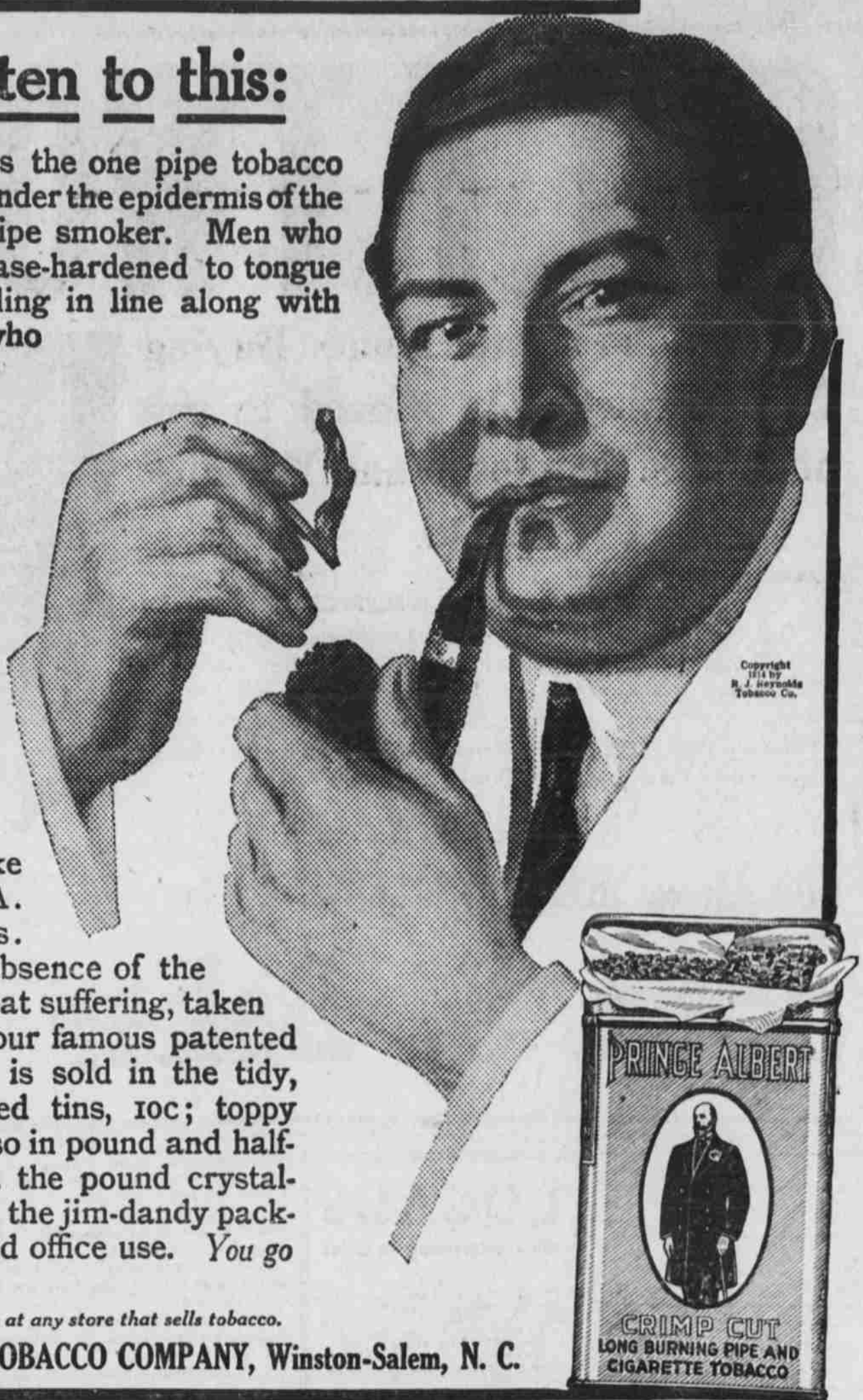
Copyright 1914 by R. J. Reynolds Tobacco Co.

R. J. REYNOLDS TOBACCO COMPANY, Winston-Salem, N. C.