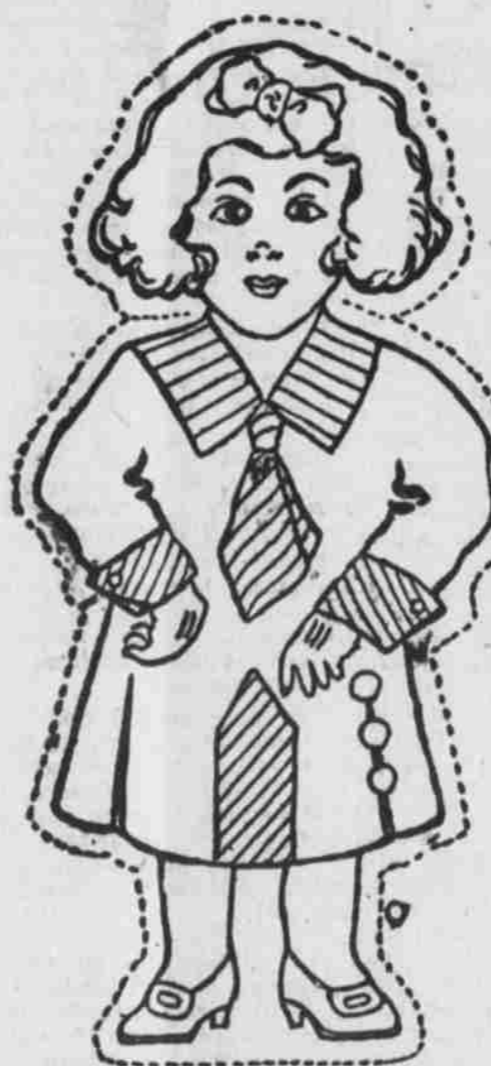
ACTUAL HEIGHT, 7 1/2 INCHES