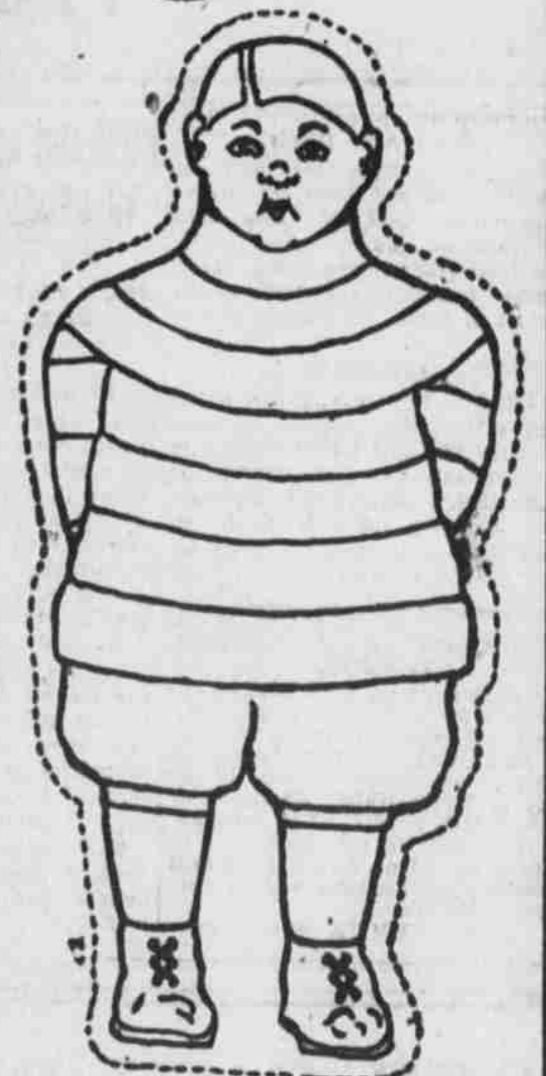
ACTUAL HEIGHT, 7 1/2 INCHES