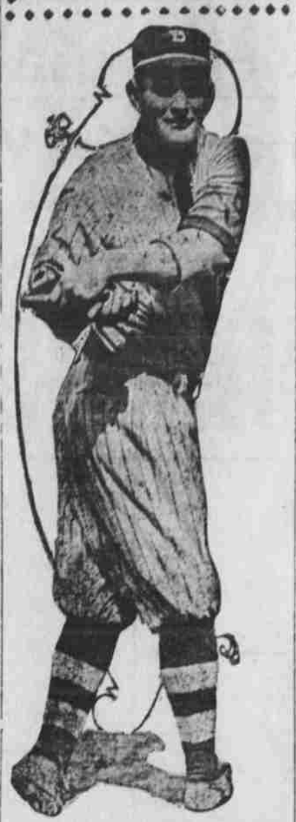
Charles "Casey" Stengel, the hard hitting comedian outfielder of the Brooklyn National League team, who has quieted the rumors concerning his alleged intention of jumping to the Federal league by announcing that he signed a contract to continue as a Dodger early in the fall. Stengel's long distance smashes as well as his comical antics on the diamond have made him popular with the fans all around the National league circuit.