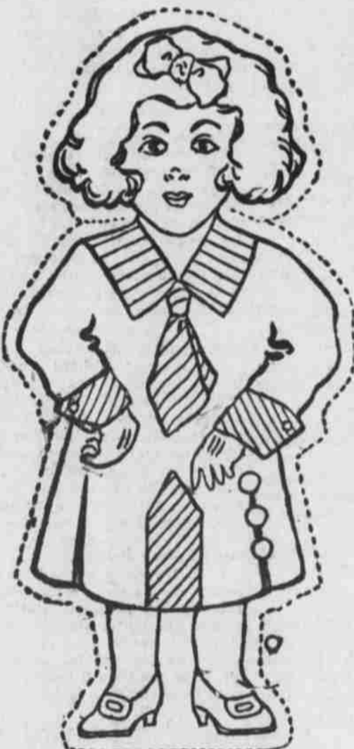
ACTUAL HEIGHT, 7 1/2 INCHES

These 3 dollies are beautifully printed on one large piece of muslin all ready to cut out and stuff. They have golden hair, big brown eyes and are very life-like indeed.