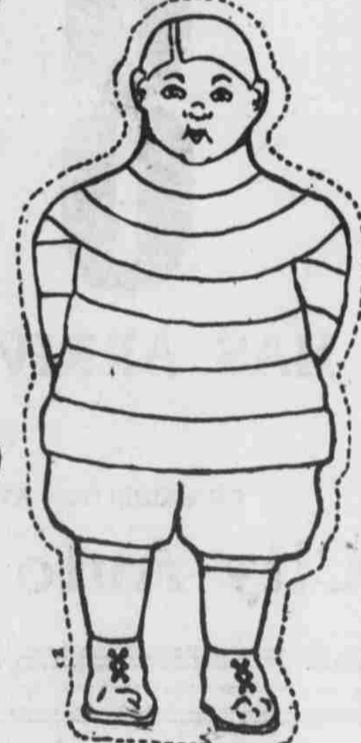
ACTUAL HEIGHT, 7 1/2 INCHES