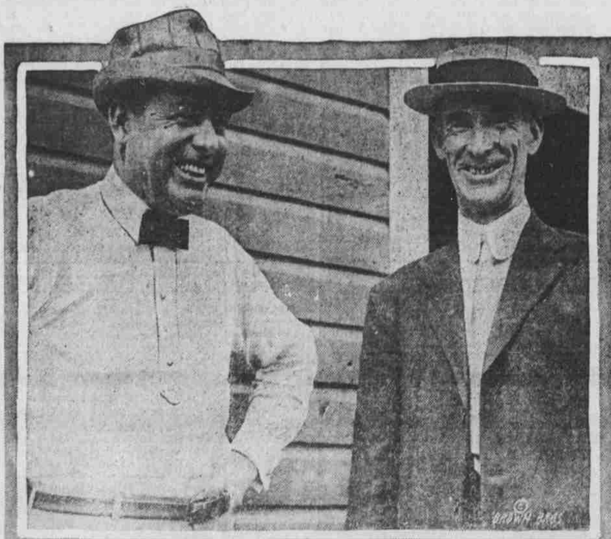
This is the last, perhaps the only, photograph taken of George Stallings, manager of the Boston Braves, and Connie Mack, manager of the Athletics, together. It is not a characteristic picture of either. Stallings does not often laugh as heartily as he is doing in this picture. He does not manage his ball club by smiling, but by driving. Mack is so solemn on and off the ball field that many friends think there isn't a good laugh in him. However, this photograph disproves it.