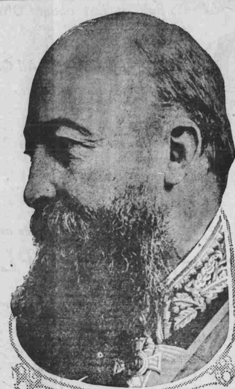
Admiral Von Tripitz, head of the German navy, who, in a remarkable interview, declared that it will not be impossible for the German submarines to cut off England's food supply by torpedoing all of her merchant marine.