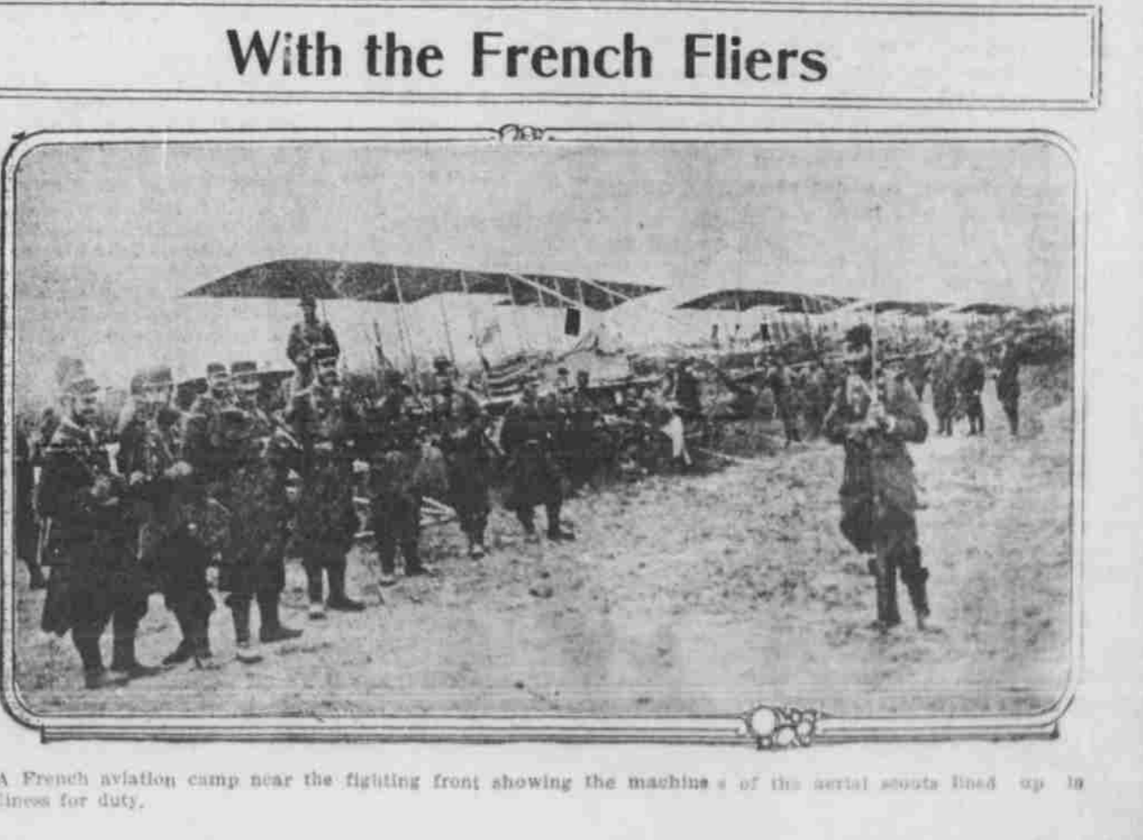
A French aviation camp near the fighting front showing the machines of the aerial scouts lined up in readiness for duty.

BUENOS AYRES, Dec. 25.—No confirmation has been received here of the wireless report from the Chilean destroyer Loma that a battle was progressing between German vessels and the British cruiser New Castle off Valparaiso. Chilean reports declare that the presence of a powerful Japanese fleet off the west coast has been confirmed. SANTIAGO, Chile, Dec. 24.—The Australian dreadnaught Australia put into Valparaiso harbor today.