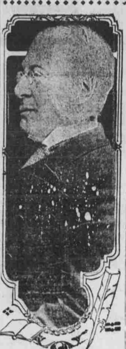
Charles W. Eliot.

BOSTON, Dec. 19.—Charles W. Eliot, president emeritus of Harvard University, speaking before the Twentieth Century Club, characterized the organization of the Standard Oil company by John D. Rockefeller, as "one of the most beneficial works ever done."