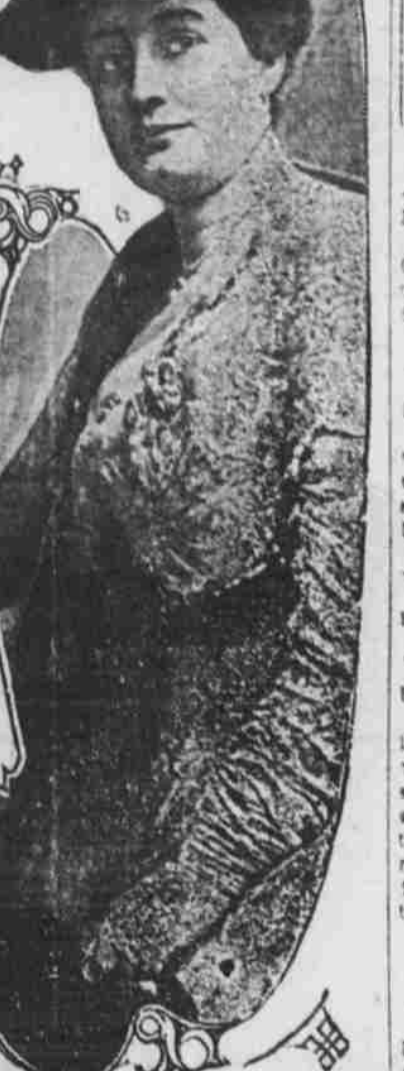
Mrs. Thomas A. Edison, wife of the "Wizard of Electricity," made her husband stay at home the day after one of his motion picture plants was destroyed by fire, despite the fact that Mr. Edison was extremely desirous of visiting the ruins to make arrangements for rebuilding. Mrs. Edison convinced her husband that she could attend to affairs just as well as himself, and went out and took entire charge of all details necessary at the ruins of the smoking $5,000,000 plant.