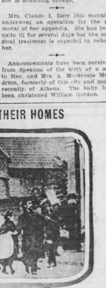
INTERNATIONAL NEWS SERVICE