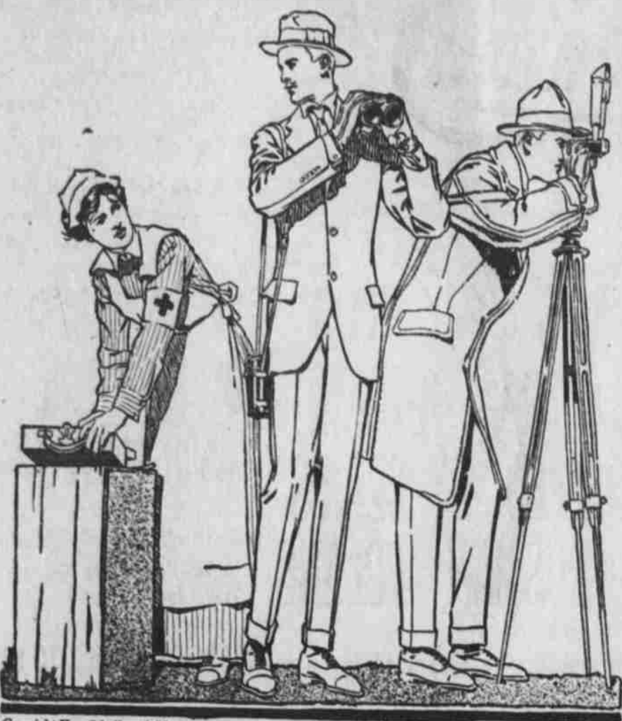
Copyright Hart Schaffner & Marx Save your T.P.W. Trading Stamps