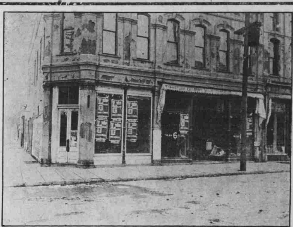
Corner of Opera House block during prohibition era in Pendleton. Note the dilapidated condition. All rooms were empty, the building run down and a sight to discourage people locating here.

Few Feeders Means Scarce Beef—The fact that fewer farmers are buying feeders this year is thought by some authorities to presage a shortage of beef cattle next year, a short-