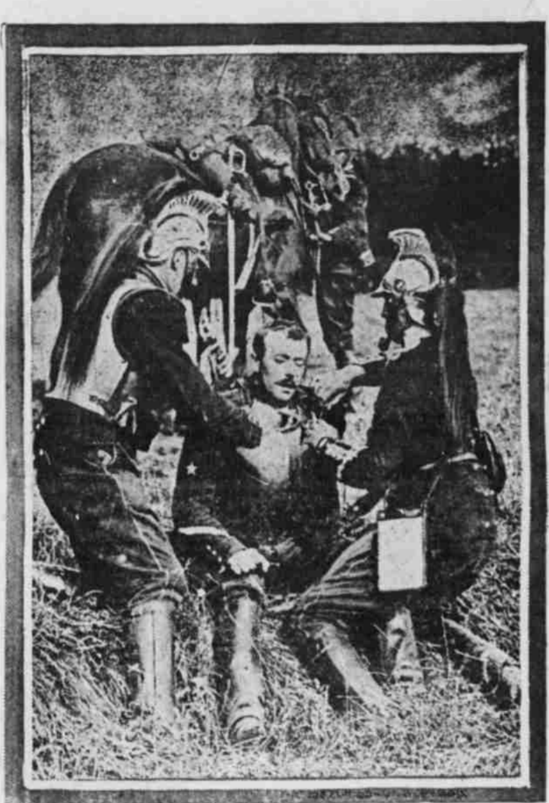
This is the photograph of a French cuirassier which these cavalrymen must carry (cavalryman) wounded at wear as part of their uniform. While the battle of the Aisne which has it is supposed to be proof against being raged in France for nearly two rifle bullets it offers little protection. Having become weak from shrapnel and bursting shells, loss of blood he had to dismount. The photograph shows the heavy steel war.

SITUATION IN WAR ZONE. The battle of Cracow may settle the European war declare military experts. Kaiser is believed to have staked all on outcome and is rushing every available man to the Russian frontier. Battle is fast developing great proportions and is expected to rage for several days. Russians are being heavily reinforced and are confident they can crush the German defense. Austrians are assisting Germans to throw back the invaders. It is estimated that 750,000 Germans have concentrated to engage in the fight. Petrograd claims that thus far in the progress of the battle the Germans have been forced to retreat.