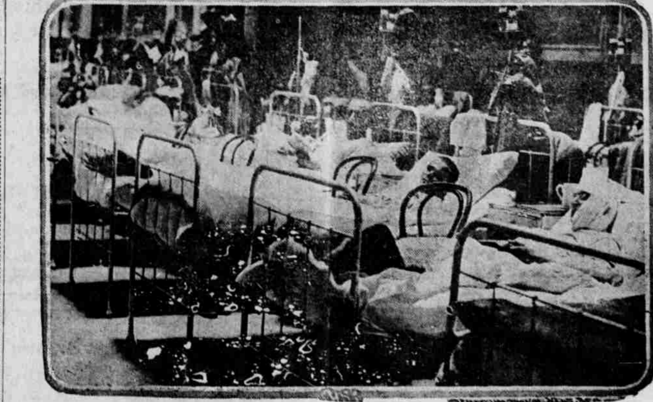
Few pictures are being passed by the German censors these days. Those shown above are the first to come from Berlin for almost a week. The upper photograph shows wounded German soldiers in the military hospital at Berlin telling their comrades who have not yet been to the front of the terrific fighting against the troops of the allies. Below is shown an interior view of the over-crowded military hospital.