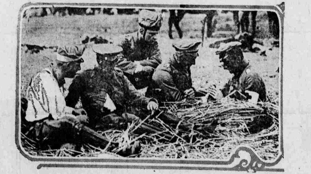
The photograph shown above is one of the first to arrive in this country taken behind the German lines. All pictures heretofore received have been of troops of the allies in action. This photo shows a group of German cavalrymen being bandaged by members of the medical corps during a lull in the fighting at Vise.