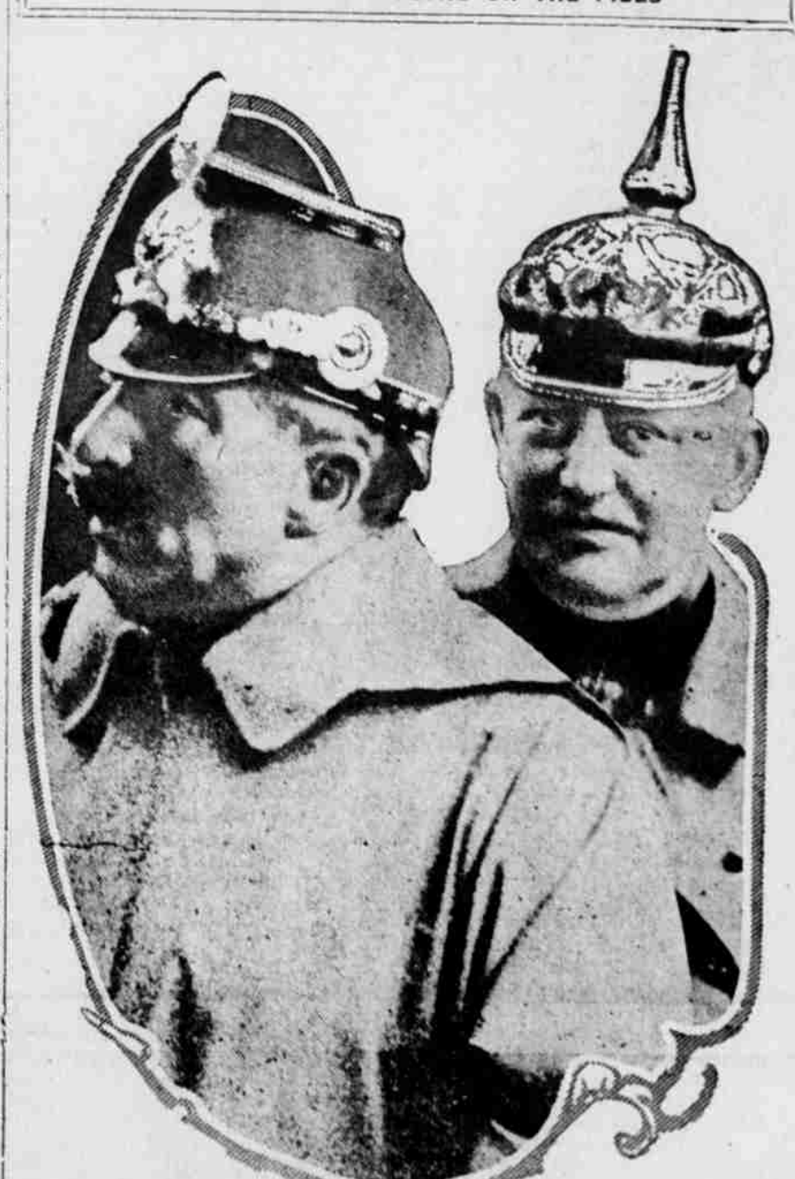
Kaiser Wilhelm of Germany is now reported to be in charge of the German troops near Metz. Behind the Kaiser in this photograph is Gen. von Moltke, nephew of the first Gen. von Moltke who engineered the German campaigns during the Franco-Prussian war in 1870.

ANTWERP, Aug. 25.—After it had done considerable damage by dropping bombs into Antwerp, a German Zeppelin was brought to the ground today within the Belgian lines by a shot from an aerogun.