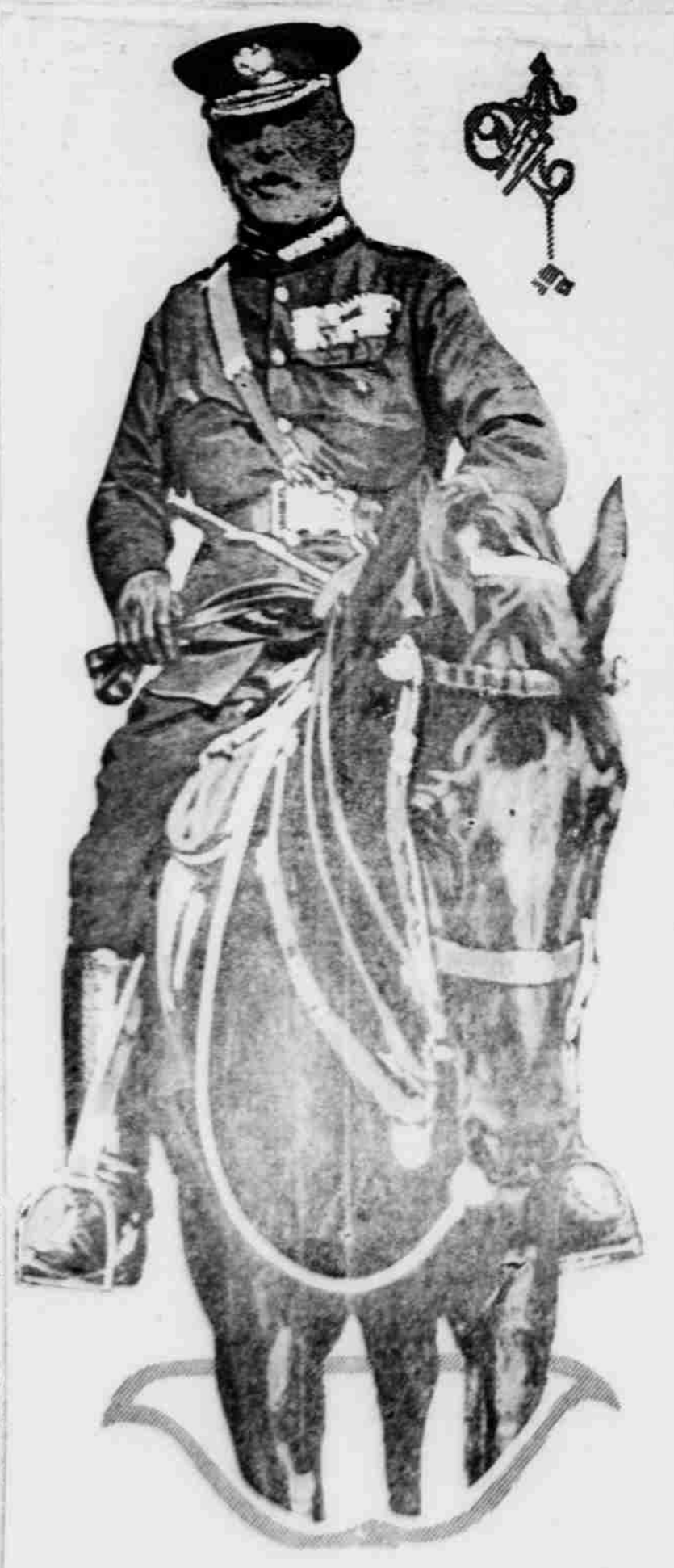
LONDON, Aug. 14.—The main body of the English army soon to be sent across the channel to France will probably be headed by Inspector General Sir John French, one of the best trained soldiers in the entire English army. It is possible the Inspector General French will assume command of both the French and Belgian armies should the three fighting forces be merged to meet the Germans.