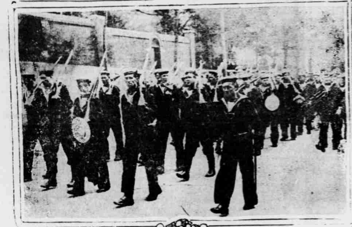
In the upper photograph two submarines making ready for departure are shown. Both England and Germany are equipped with submarines and these man-controlled monsters of the deep are bound to play havoc with the fleets of the enemy. The lower photograph, just received from England, shows a regiment of coast guards on its way to the mobilization point. These men were among the English army of 22,000 that has already been landed on the continent to battle with the Germans.