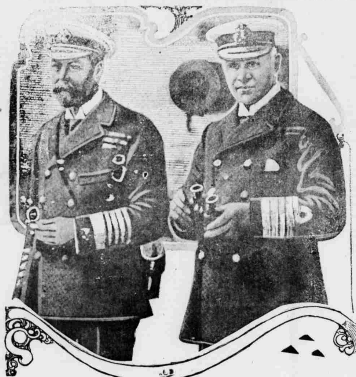
King George V, (left) and Admiral Callaghan photographed on the deck of the latter's flagship on the occasion of the king's recent visit to the fleet at Spithead. Admiral Sir George Astley Callaghan, K. C. B., an Irishman, is the commander in chief of England's fleet, the largest in the world. The fleet is under orders to seek the German flotilla in the North Sea. A battle is expected momentarily.