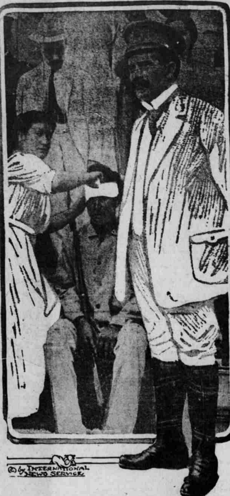
General Pablo Gonzales, the captor of Tampico, is here shown visiting one of his wounded soldiers, who is being tended by a White Cross nurse.