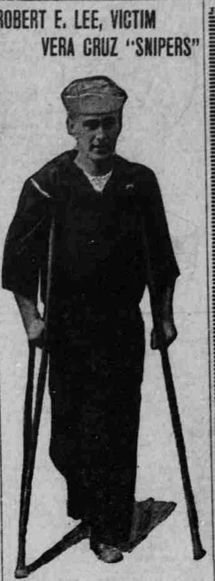
ROBERT E. LEE, VICTIM VERA CRUZ "SNIPERS"