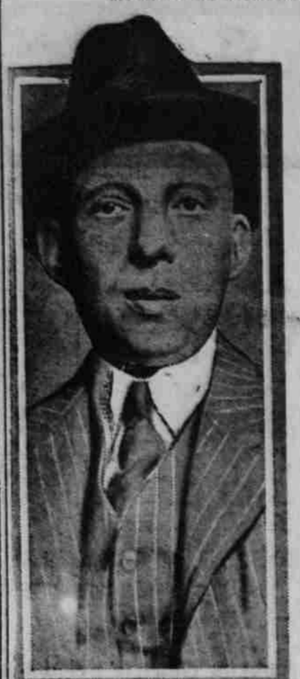
JACK ROSE TWO YEARS AFTER HE AIDED IN ROSENTHAL MURDER

Jack Rose, who, according to his story in the trial of Charles Becker, former police lieutenant of New York City, was Becker's chief agent in the murder of Herman Rosenthal, again took the witness stand when the case against Becker was called. He told much the same story he had given on the first trial.