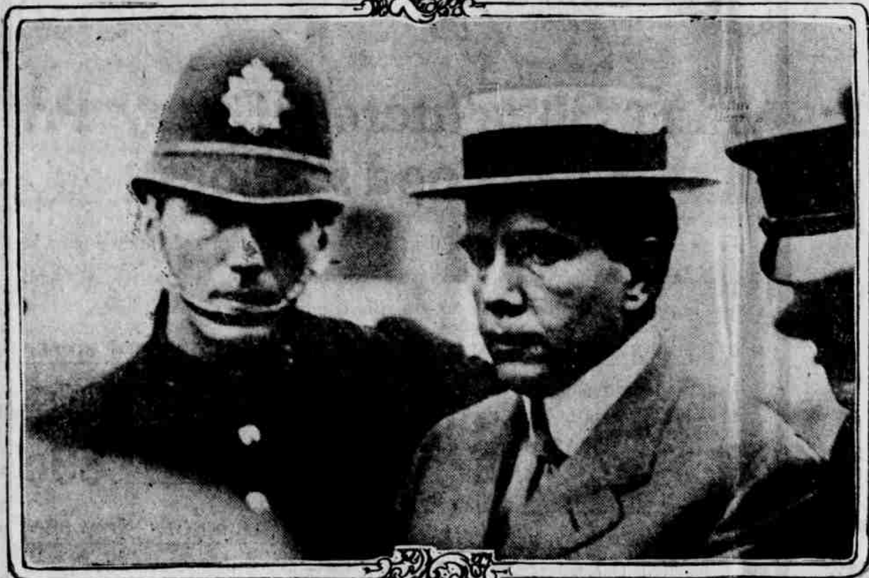
Harry K. Thaw in the Hands of the Canadian Police as Shown in Moving Pictures at the Cozy Theater. Tonight the Last Night.

Not Like Western Oregon. It was contended by the game warden that by eating down the growing wheat than geese help it and do not hurt it. This the farmers indignantly deny.