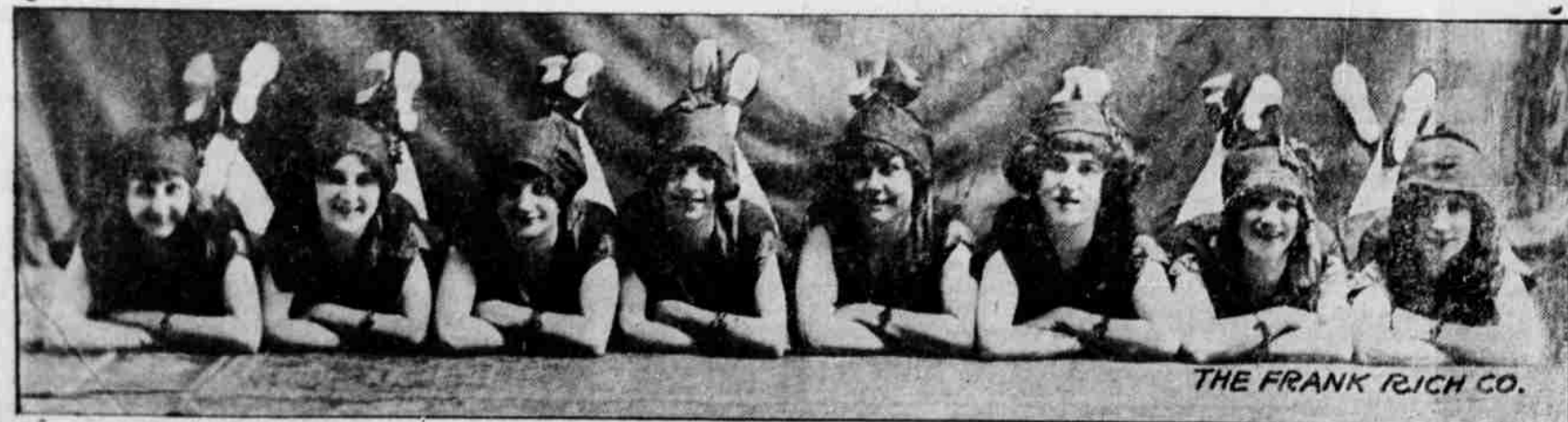
THE FRANK RICH CO.

The effect of two lace flounces falling softly and edged with lace and finished at the waist with crushed girdle of satin is graceful, stylish and economical.