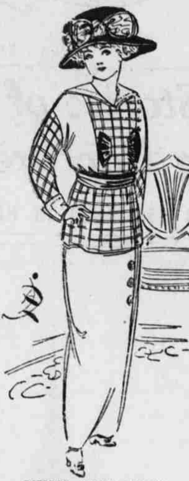
SCHOOL GIRL'S FROCK.

WASHINGTON, Nov. 17. (Special)—The secretary of the interior has announced that the installment of building charges on the government irrigation projects which falls delinquent on December 1, 1913, is reduced to one-third the installment and the installments of building charges which fall delinquent on March 1, April 1, and May 1, 1914, respectively, are reduced to one-third of the installment, but not less than 50 cents per acre in any case. No proceedings for cancellation on account of delinquencies previous to the dates mentioned will be taken until the dates named. The installments which become due on those dates will not become delinquent and payable until the expiration of twelve months thereafter.