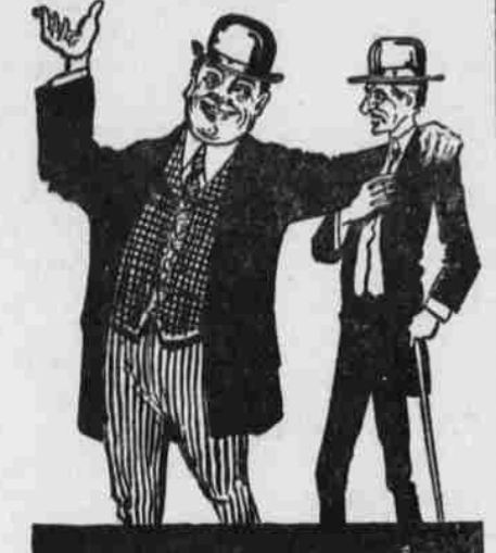
S. S. S. is a Wonder. It Makes You Look and Feel the Picture of Real Health.

With your blood full of catarrhal infection, nerves all unstrung, blood impoverished, headaches, lassitude, pellagra, hookworm, tape worm, chills and fever or some other debilitating influence, the very foundation of health is being sapped away by spring humors.