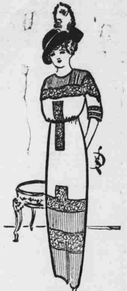
COTTON CREPE FROCK. The drawing above shows a charming frock of white cotton crepe, cluny lace and striped pongee. The upper collar is of the striped material, the square tab inserted on bodice and skirt is of the lace and the sleeve is banded with the same. The skirt is close-fitting, with two bands of the trimming at the bottom and separated by a band of the pongee, the same finishing the bottom. This is a most effective little frock, easily made and inexpensive. The hat worn with it was a white chip with red aigrette.

Veils Now Often Discarded. Veils are very much less worn than they used to be in past seasons. They are less easy to wear with very small hats, for the simple reason that they may easily touch the eyes or at least the eyelashes; but, since the extremely small hat is specially reserved for the very young woman, she may well permit herself to meet the full glare of daylight in the street without any softening veil. Besides this, some hygienic people pretend that the veil is harmful both to the complexion and the sight, and while it is also true that the contrary opinion is held the devotee of fashion will follow her own personal opinion without bothering her head about any other.—Paris Edition of New York Herald.