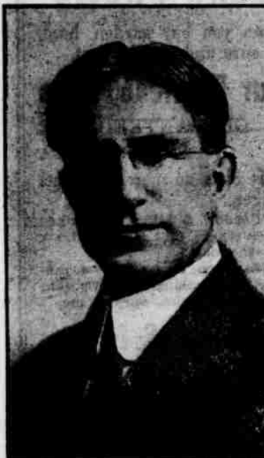
GEO. T. COCHRAN

Progressive Republican Candidate for nomination Representative in Congress Second District.