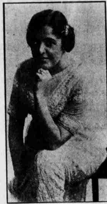
Prima Donna, in "Miss Nobody From Starland" at the Oregon Theatre Tomorrow Night.