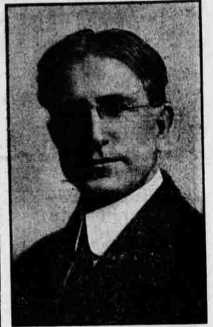
GEO. T. COCHRAN Progressive Republican Candidate for nomination Representative in Congress Second District.