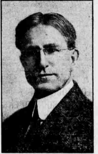
GEO. T. COCHRAN

Progressive Republican Candidate for nomination Representative in Congress Second District.