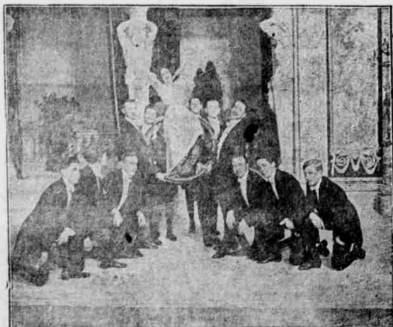
Scene from "THE KISS WALTZ" Casino Theatre, New York

This Song Free in Next Saturdays East Oregonian