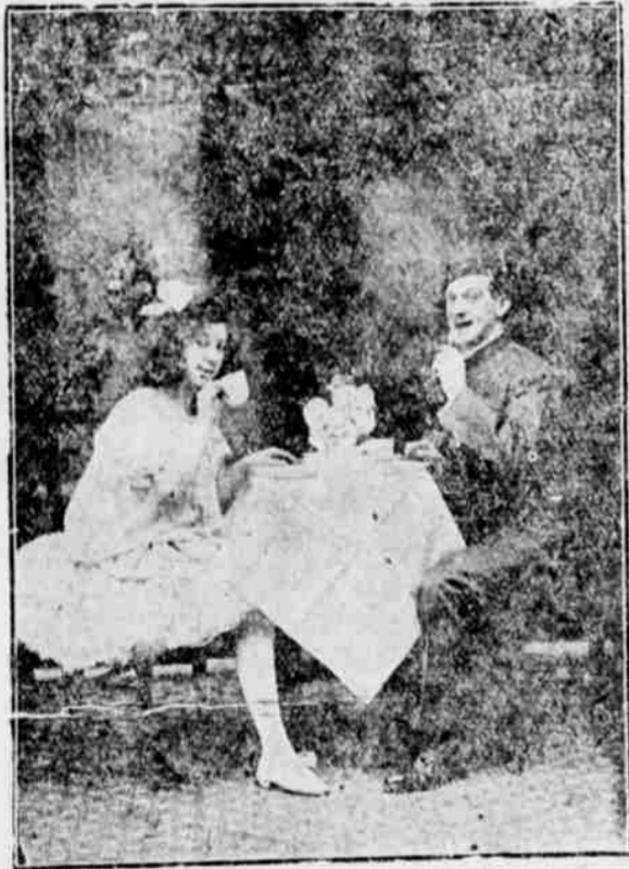
Big Orpheum Circuit Act Now on at the Grand Theater.