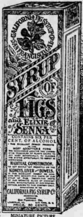
MINIATURE PICTURE OF PACKAGE.