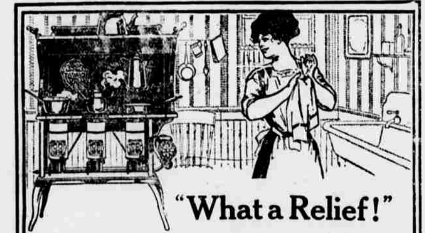
"What a Relief!"

Inferring from the aftermath, some of the enthusiastic editorial writer would have done well to have refrained from commenting on the beneficial effects of the Standard Oil decision until all the returns were in. —Watsonville Register.