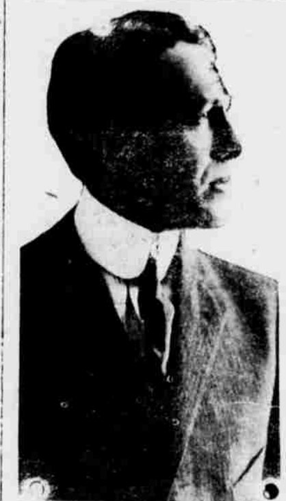
"The Spendthrift," Oregon Theater, Tonight.