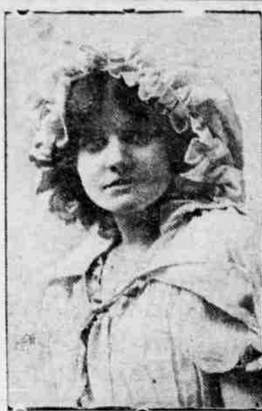
"The Spendthrift," Oregon Theater, Tonight.