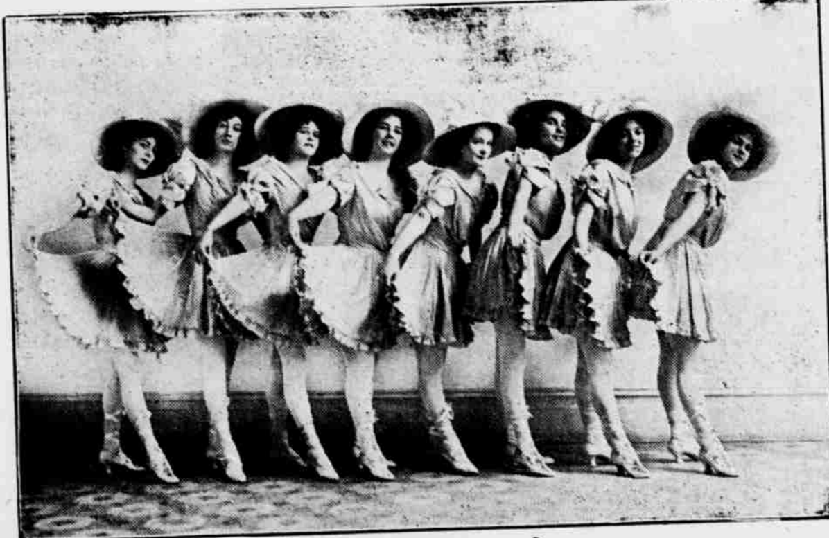
Bathing Girls, "3 Twins," at the Oregon Theater, February 15.

KOEPPEN'S The Drug Store That Serves You Best