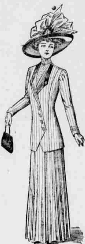
McCall Patterns Nos. 3543-3553 STYLISH MODEL

They are all this season's best styles and makes. Everyone high class hand tailored suits. Alterations free.