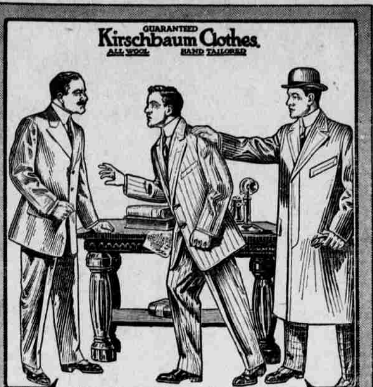
From the reproduction in oil of a scene from "The Third Degree," showing the male characters as they would appear dressed in Kirschbaum Fall and Winter models (reading from left to right) Clayton, Elektra and Fifth Avenue Overcoat.

YOU can't get something for nothing! And the few cents you'd save on the initial cost of a poor suit are no compensation for an unattractive appearance—a coat that pinches or binds over the chest, or trousers that are too tight over the thigh. You get a good deal more than the price represents when you pay $15 to $35 for a Kirschbaum Suit. You get "All-Wool" fabrics, genuinely hand-tailored clothes that fit, wear and keep their shape—and an unqualified guarantee that goes with each garment. Prices $15 to $35. Ask to see the Reggy Model, the specially designed garment for the young gentlemen of America. Look for the "Kirschbaum Label." It is the identification mark of the best clothes made at the price. Workmen's Clothing Co. Corner Main and Webb