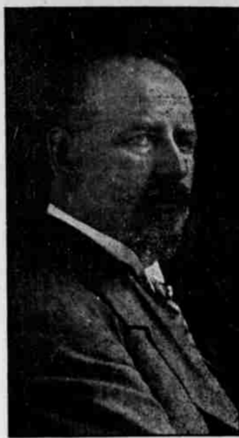
Ex-Mayor of Milwaukee.