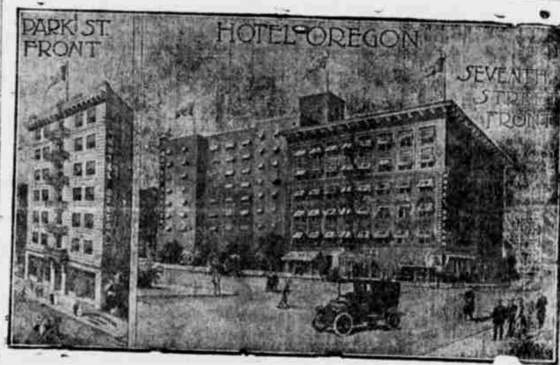
Hotel Oregon, located corner of Seventh and Stark Streets, extending through the block to Park Street, Portland, Oregon. Our new Park Street Annex is absolutely fireproof.

Daily East Oregonian by carrier only 15 cents per week.