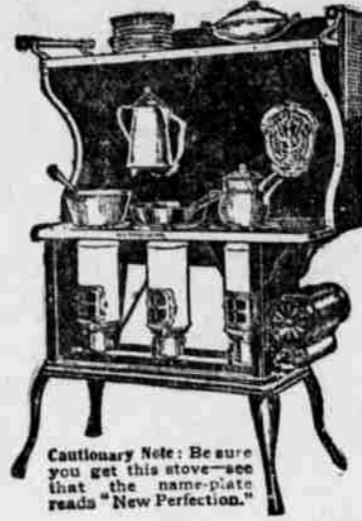
Cautionary Note: Be sure you get this stove—see that the name-plate reads "New Perfection."

According to the report of the government voluntary weather observer at Weston, Herbert Baker, during the month of May there was a total rainfall of 1.53 inches. The average maximum temperature was 78 degrees and the minimum 45 degrees. There were 20 days clear and partly clear during the month, and seven days dur-